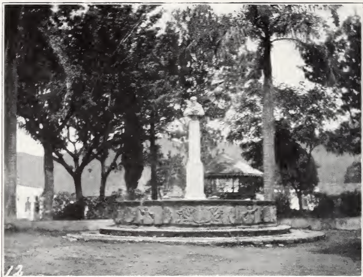
Fountain and Monument to Padre Sera